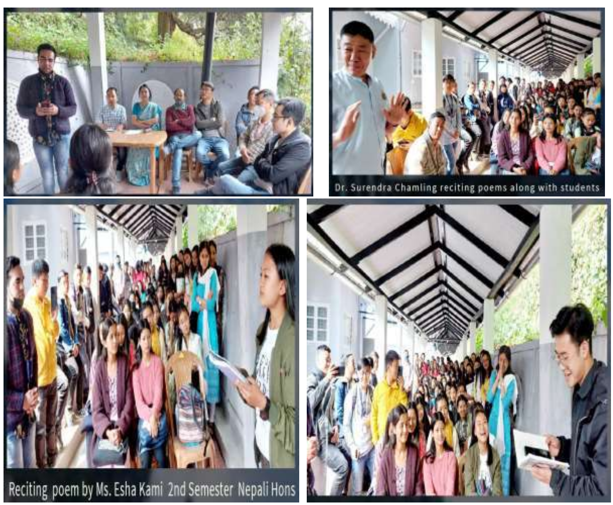
Celebrating Biswa Kavi DiwaS

Phone / Fax: (0354) 2254078 (0354) 2254019 Email : dgc.principal@gmail.com